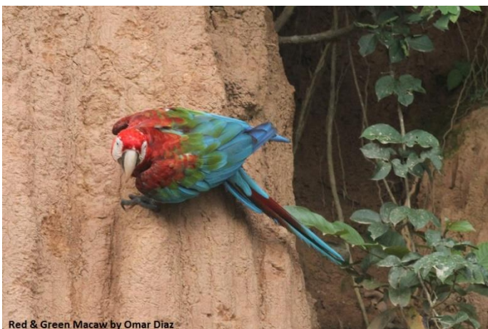
Red & Green Macaw

Morning birding along the trails and after we will start our trip back to Puerto Maldonado. After nice lunch in our favorite restaurant will do some birding for the Purus, White-throated, Bluish-fronted Jacamars, Straight-billed Woodcreeper, Hooded Tanager, Red-bellied, Blue-headed Macaws, Rusty-backed Antbird, white-faced whistling-duck, Brazilian Teal, Southern, Pied Lapwings, Collared Plover and many