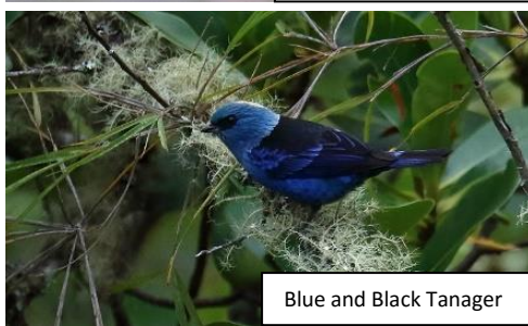
Blue and Black Tanager