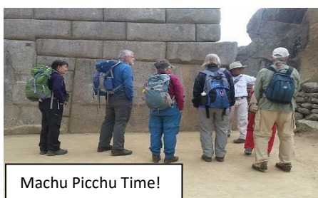
Machu Picchu Time!

THANKS VERY MUCH FOR COMING AND JOIN PERU BIRDING TOURS FAMILY☺