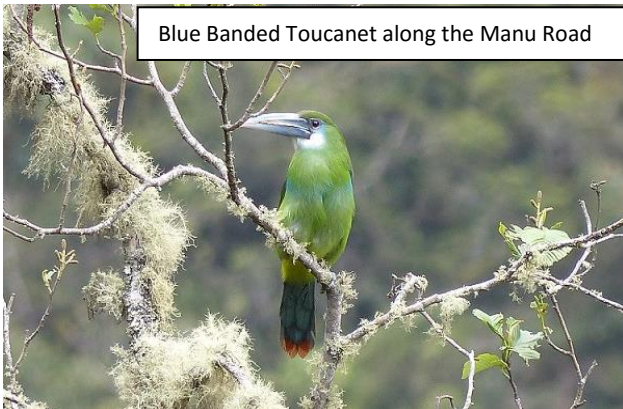
Blue Banded Toucanet along the Manu Road

Once at Wayquecha Station we had an early birding start getting some cool birds like Andean Guan, White Throated Hawk, Rufous Capped Thornbill and others to then come back for breakfast packed and be ready for our next stop at Cock of the Rock Lodge, after lunch we went down the road and got some more birds like Golden Headed Quetzal, Barred Parakeet and some others.