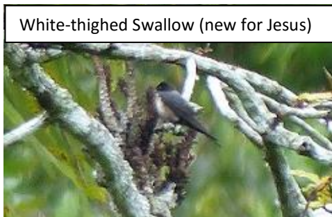
White-thighed Swallow (new for Jesus)

Another birding day by boat along the river with some birds like Great Black Hawk, Zone Tailed Hawk, Black Caracara and Orinoco Goose to then take a car to get to Puert Maldonado with some stops for birds on the way too. Beautifull day with very Lucky view of White Tailed Hawk and Gray Hawk. Once at Puerto Maldonado we had our last Supper together at Burgo's Restaurant celebrating a cool 10 days birding tour with Pisco Sour on the table ii