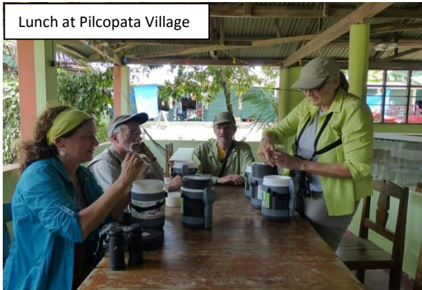
Lunch at Pilcopata Village